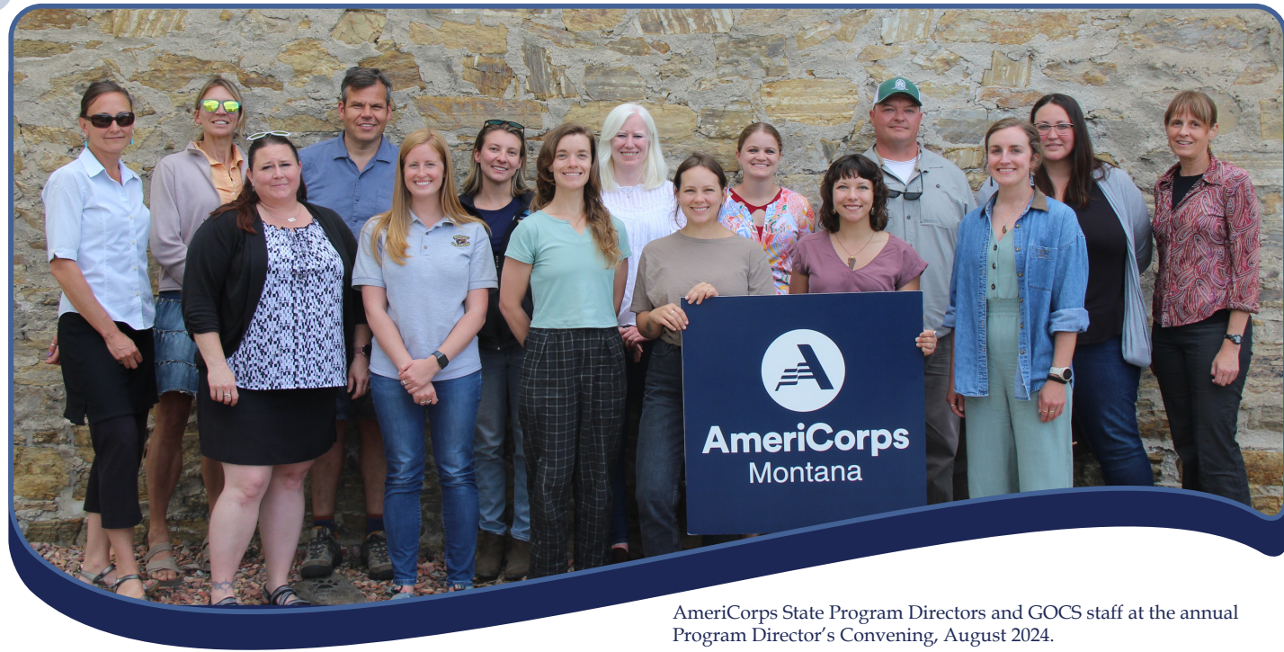
AmeriCorps State Program Directors and GOCS staff at the annual Program Director's Convening, August 2024.