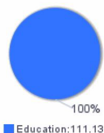
Table1: MSYs by Focus Areas