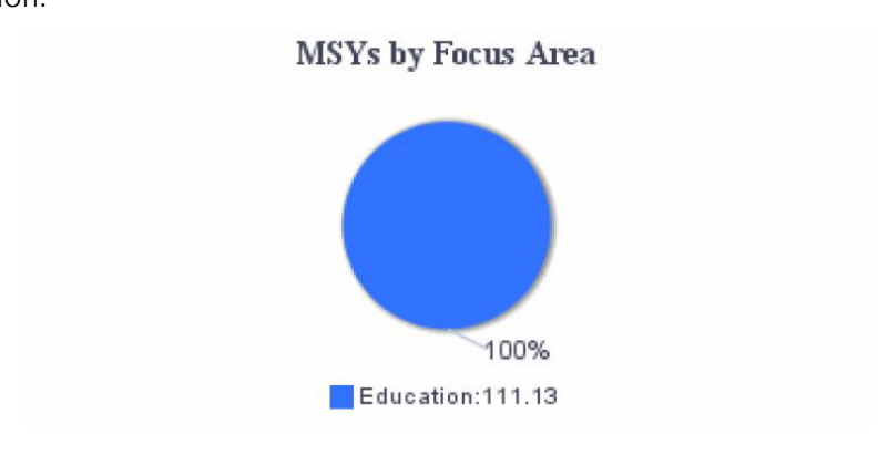
Table1: MSYs by Focus Areas

Table 1 and its corresponding pie chart show the total number of MSYs by Focus Area. Since both the K-12 Success and School Readiness objectives are in the Education Focus Area, Table 1 shows 100% of MSYs in Education.