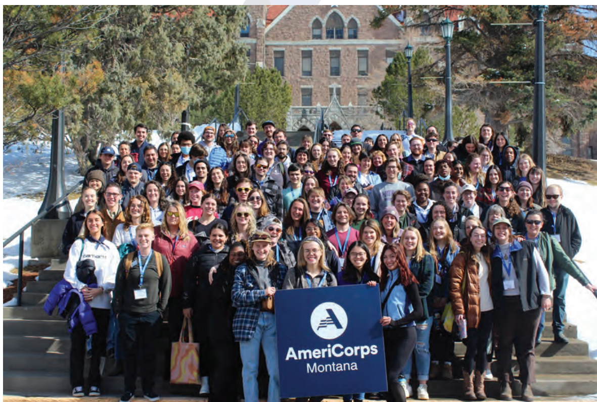
Photo: AmeriCorps members pose for a group photo during the ServeMontana Symposium, March 2023.