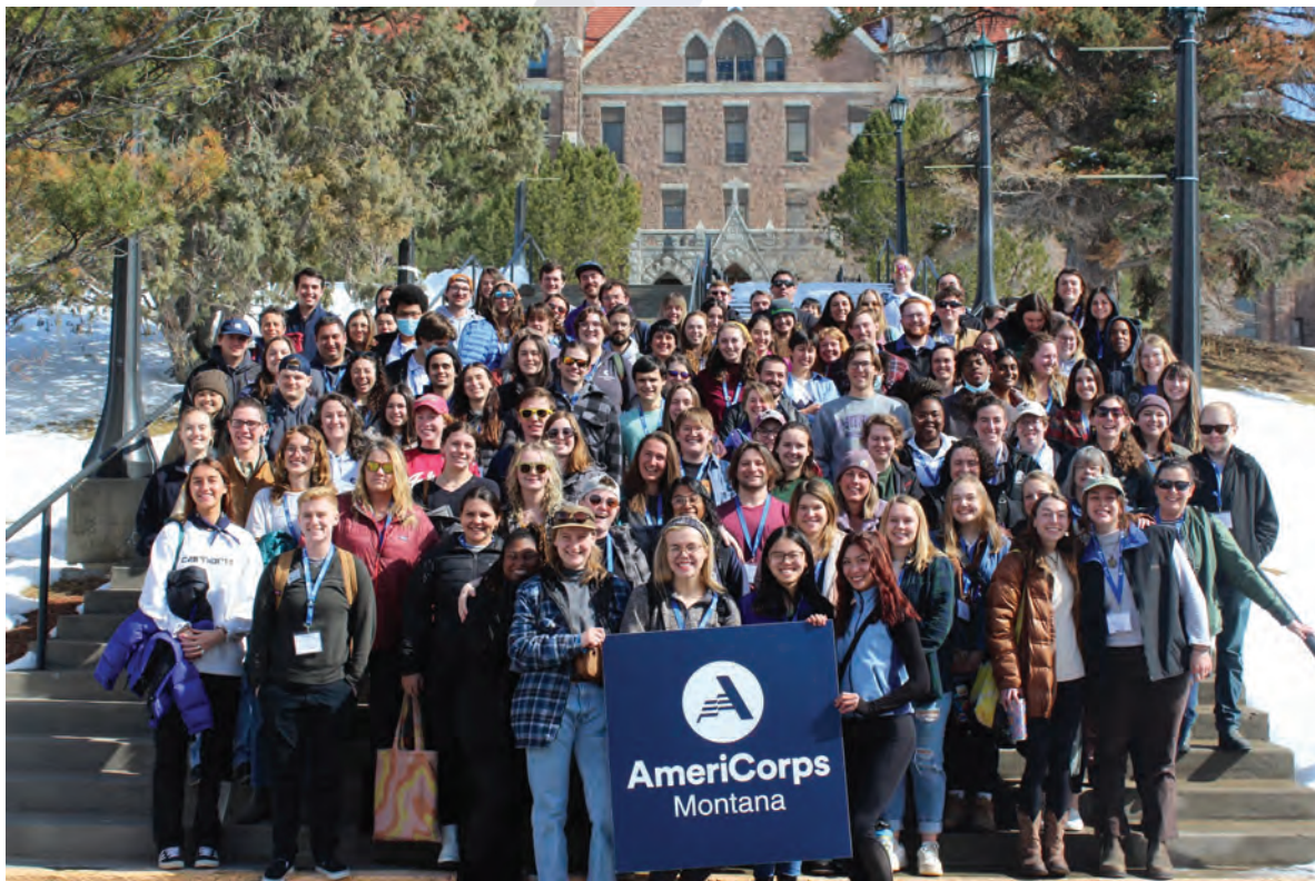
Photo: AmeriCorps members pose for a group photo during the ServeMontana Symposium, March 2023.