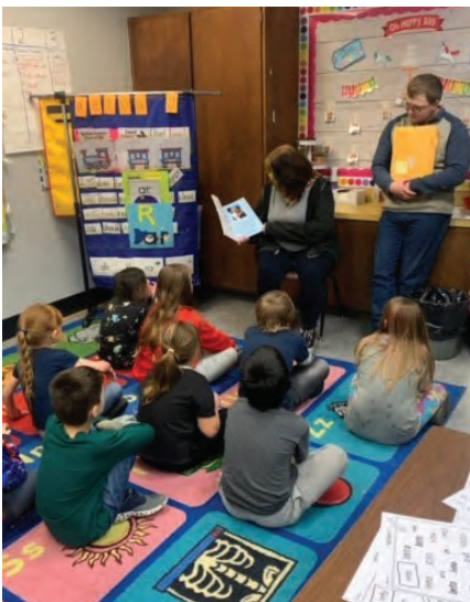
Photo: Montana Campus Compact members read to students for MLK Day of Service

Provide volunteer management training for all AmeriCorps and AmeriCorps Seniors by partnering, supporting costs of attendance, and where logical, sponsoring the training.