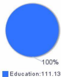
Table 1: MSYs by Focus Areas