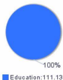
Table 1: MSYs by Focus Areas