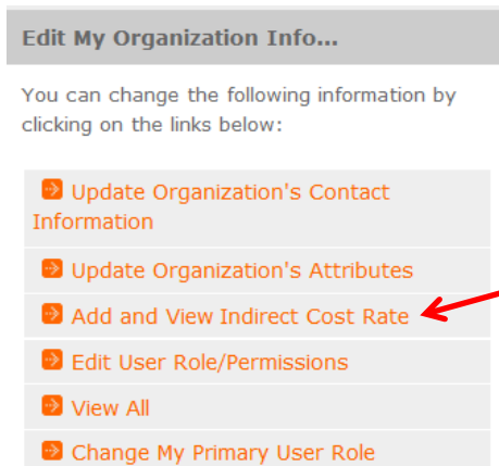
Figure 2: Add and View Indirect Cost Rate